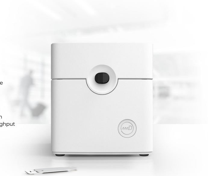
Prototype. Not for diagnostic use.

Easy menu expansion for other infectious diseases (e.g. Flu, RSV)